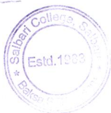
Principal, Salbari College Principal